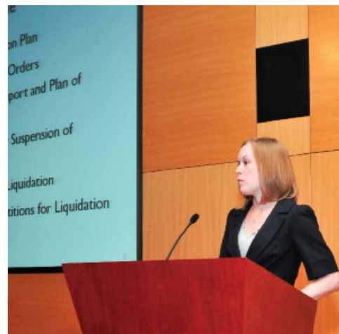
The New Board Member Orientation Program and Major Insolvencies/Rehabilitations Briefing were well-attended and well-received by guaranty association board members and administrators.

economy by noting that "the past recession was the deepest and longest in the post-war era. The recovery is also the weakest in the post-war era." He added that while recessions typically take their greatest toll on Main Street, in the most recent recession, "both Main Street and Wall Street took it on the chin."