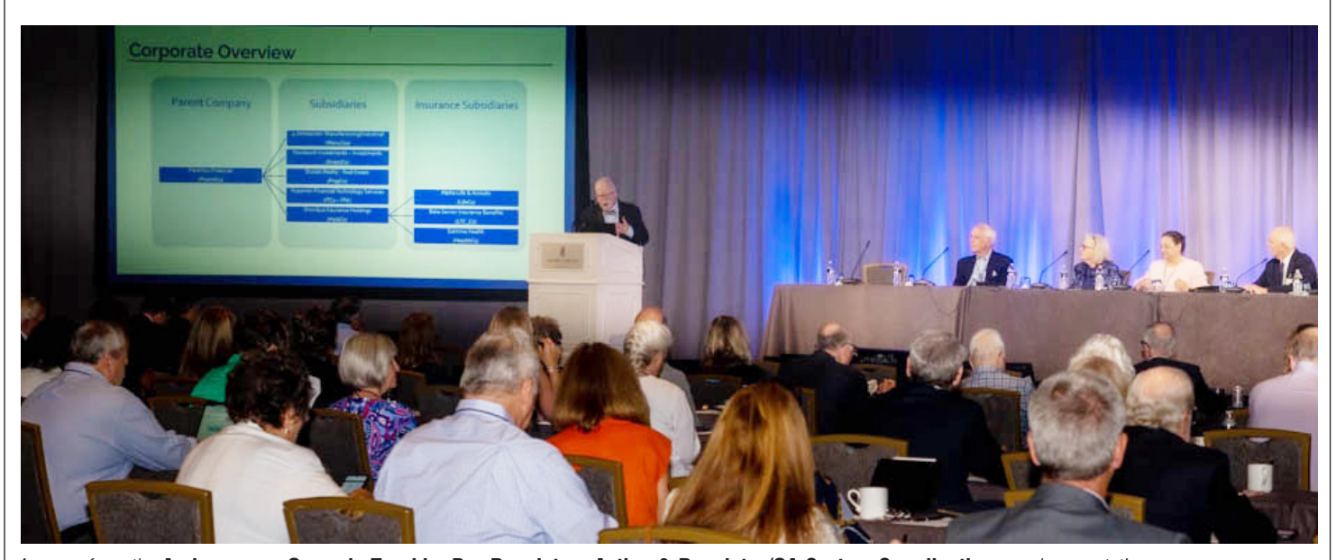
A scene from the An Insurance Group in Trouble: Pre-Regulatory Action & Regulator/GA System Coordination panel presentation.

Actually, each panel presented attendees with specific questions before sending them off to breakout sessions, in which the various groups discussed the