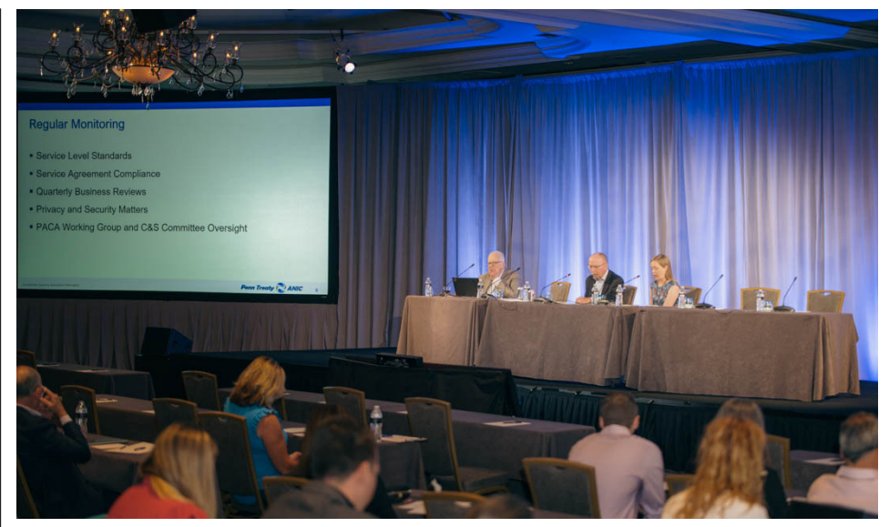
A report from the July 2022 MPC meeting.

We've also had to rethink some of our basic assumptions. "For a lot of years, we may have implicitly taken for granted that most people in our system had what I'll call 'a foundational knowledge' of the insolvency system and how guaranty associations operate together to respond